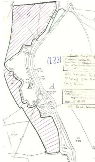
Common Land on the road to Cote Mill from Eastleach